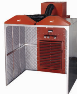
Clean Air Booths