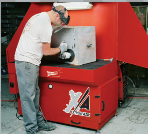
Captures dust from filling operations