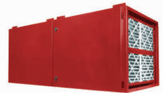
Ambient Air Cleaners